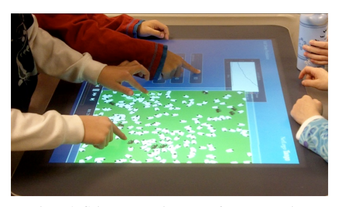
Figure 1: Children exploring the wolf-sheep predation model in NetTango

Studies have suggested that interactive tabletops have the potential to be productive tools for collaboration and learning [2, 10, 14, 17]. Specific applications have included: biodiversity, reading, fractions, the physics of light, quadratic equations, language learning, and genomics [5, 9, 11, 13, 14, 17, 18].