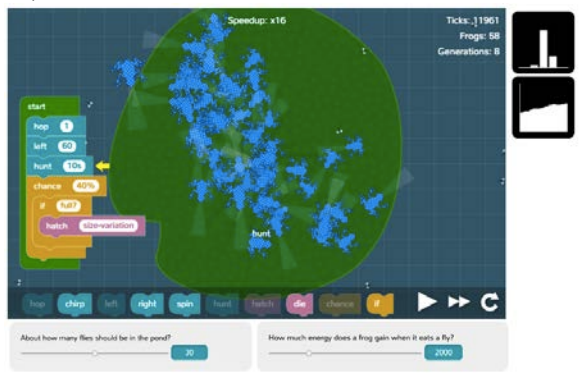
Figure 1. A student-generated program.

In the Frog Pond environment, learners program instructions for a group of frogs in an ecosystem using domain-specific, blocks-based primitives (See Figure 1). There are eight behavioral blocks ("hop", "chirp", "left", "right", "spin", "hunt", "hatch" and "die"), two logic blocks ("if" and "if- else"), and a probability block ("chance"). Students can drag and drop these blocks to construct a program. On running the program, each frog repeatedly enacts the encoded instructions to interact with other frogs and a simulated environment that includes lily pads and flies. Within this environment, variations in frog size have multiple tradeoffs. More information about Frog Pond is available here: http://tidal.northwestern.edu/nettango/. The simulation can result in changes in the frog population: 1) growing bigger or smaller (directional pressure), 2) staying around the same size (stabilizing pressure), or 3) separating into two distinct sub-populations, consisting of larger and smaller individuals (disruptive pressure).